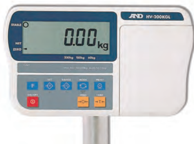
Large LCD Display