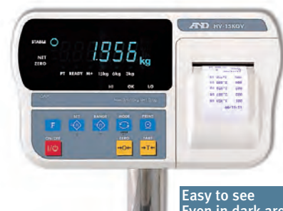
Large VFD Display